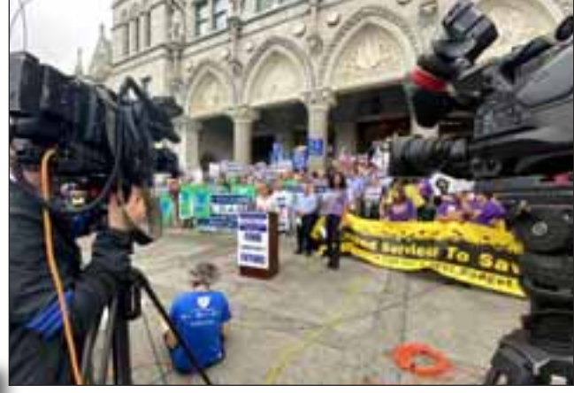
PICTURED ABOVE: News cameras film the event's speaking program and crowd's march.