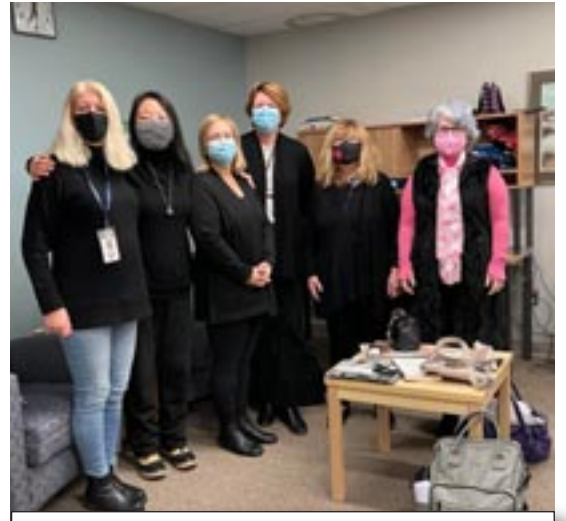
Paraeducators at New Fairfield High School snap a picture together before school in support of #BlackOutForSafeSchools