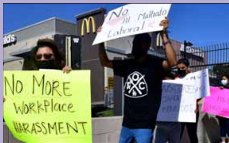
PICTURED ABOVE: McDonald workers and supporters joined together on May 19th all across the country to protest unanswered workplace harassment complaints, low wages and poor working conditions.