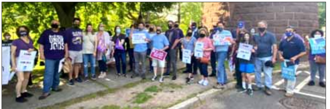
PICTURED ABOVE (TOP): Hundreds of Recovery For All coalition members march around the State Capitol chanting demands to Governor Lamont. (BOTTOM): CSEA Members meet down the street from the Capitol before the march kicks off.