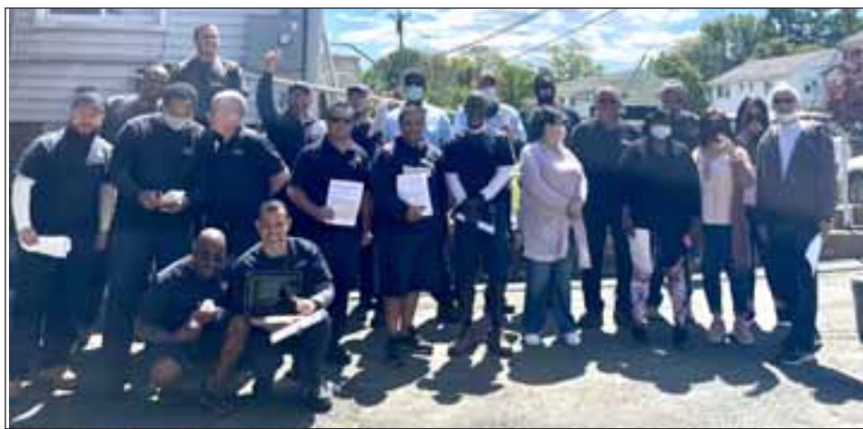
PICTURED ABOVE: The Norwalk Housing Authority Bargaining Unit Celebrates their Negotiation Kick-Off!

Members Meet up to Get Fired Up and Excited Over Upcoming Fight!