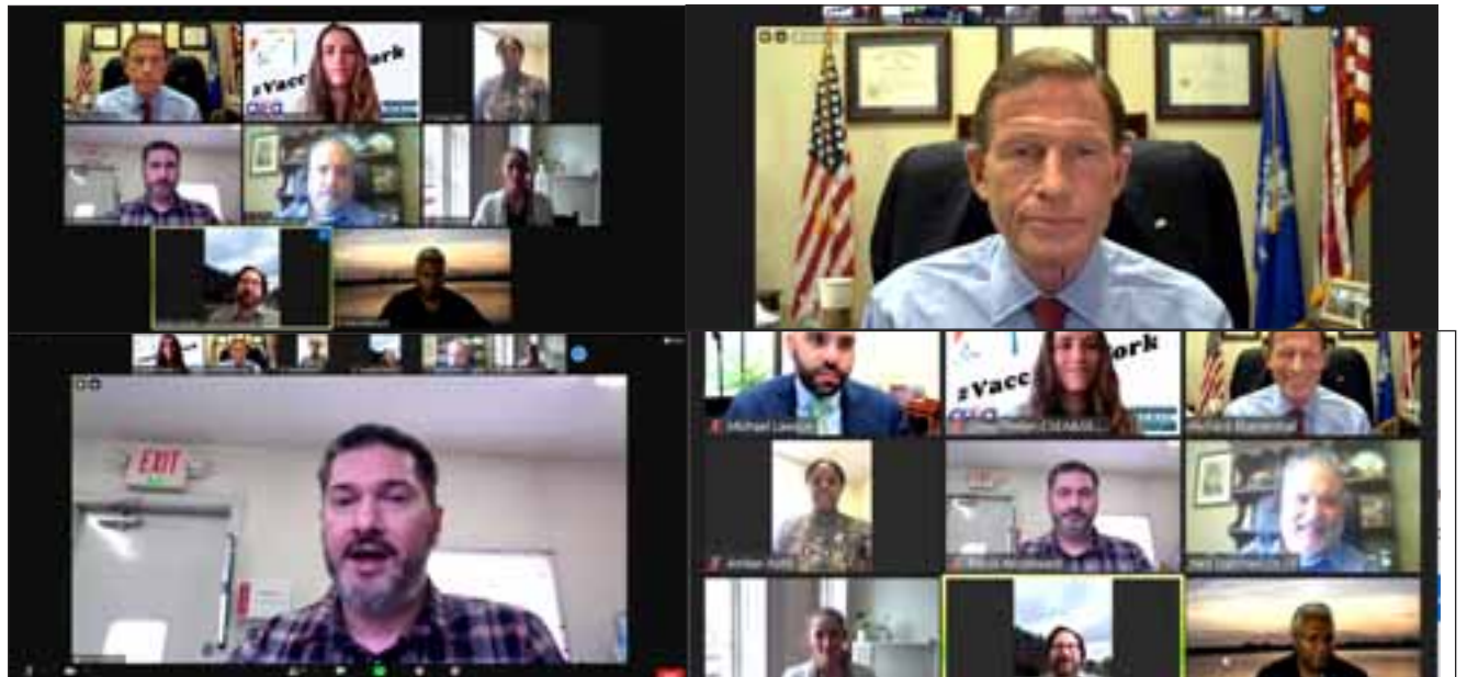
PICTURED ABOVE: Members address Senator Blumenthal on the American Jobs Plan in a small group setting via Zoom.

These points were positively taken into consideration by the Senator and CSEA looks forward to working with his office in the future on these important issues.