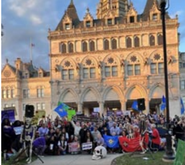
ABOVE: Nearly 200 activists gathered in front of the State Capitol.

these budget cuts cast a daunting shadow of uncertainty over Connecticut's higher education system. Their far-reaching implications extend to students, faculty, and staff, creating an atmosphere of unease. Moreover, these chilling reductions are set to complicate negotiations for 2024 and 2025, further intensifying the uncertainty that envelopes higher education in the state.