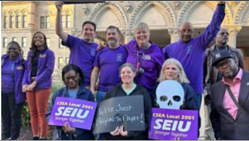
ABOVE: CSEA members joined 200 supporters to demand Governor Lamont address the $200M deficit in our public higher education institutions.