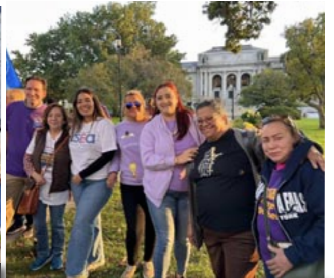
ABOVE: Childcare council members showed their solidarity at the rally!