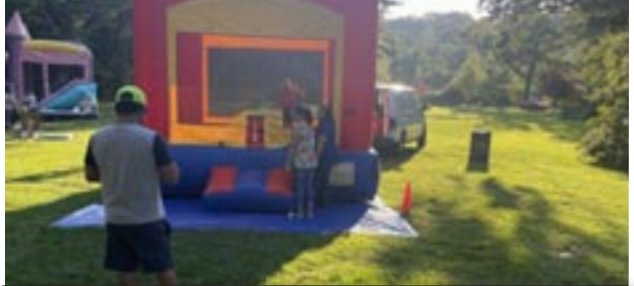
ABOVE: The picnic was a family-fun event complete with a bouncy house.

Childcare Providers gathered on a sunny August day to celebrate each other and the new childcare contract. Their partners and kids joined in on the festivities. Providers look forward to more in person events this com in year. If you are a provider and do not receive e-vites to events make sure to update your email info at: CSEA-CT.com