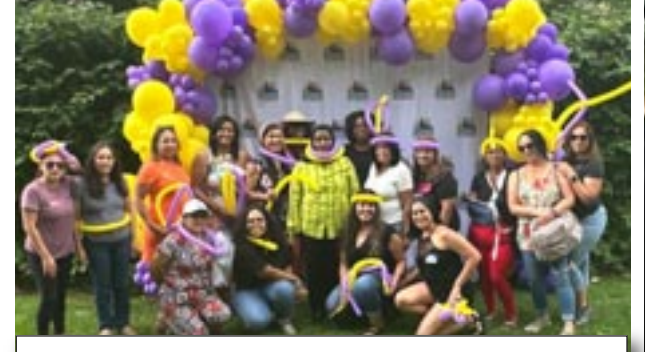
ABOVE: Members celebrated their #UnionWin with a picnic and quality time together!