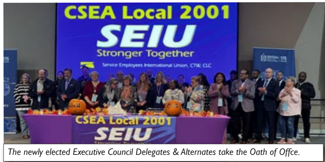
The newly elected Executive Council Delegates & Alternates take the Oath of Office.

Childcare members joined long-term care SEIU workers to knock doors in Connecticut as a part of the nationwide SEIU "Care Canvas" days. These canvas efforts centered on union members across the state in support of SEIU endorsed candidates, candidates